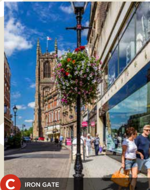
C IRON GATE