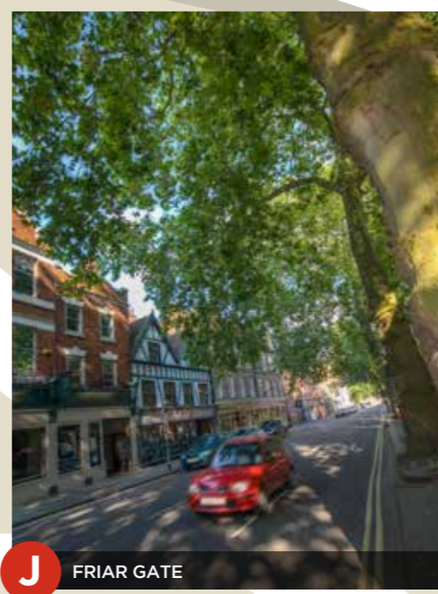
J FRIAR GATE