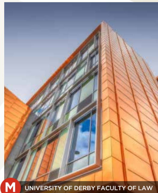
M UNIVERSITY OF DERBY FACULTY OF LAW