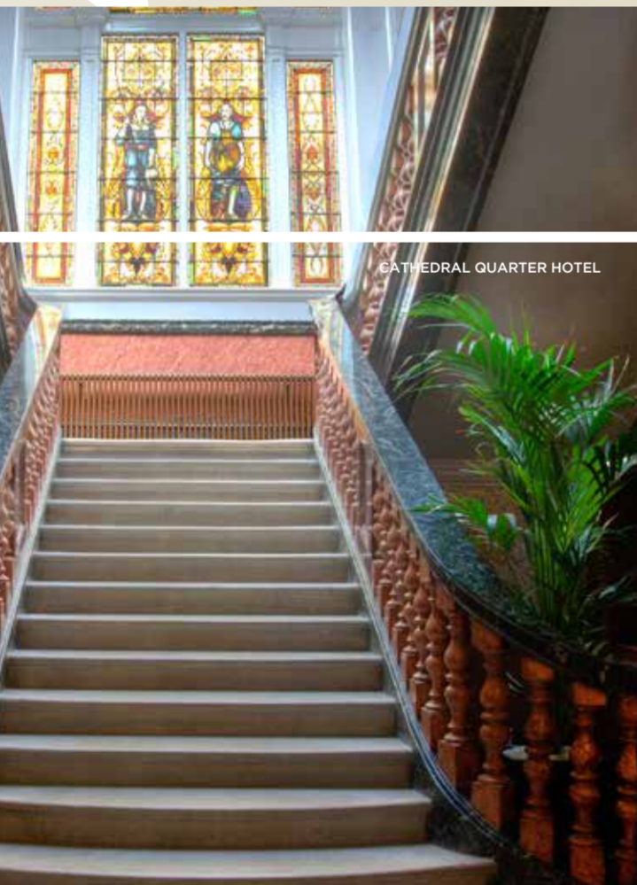
CATHEDRAL QUARTER HOTEL

All hotels offer free wi-fi with car parking close by in secure multi-storey car parks.