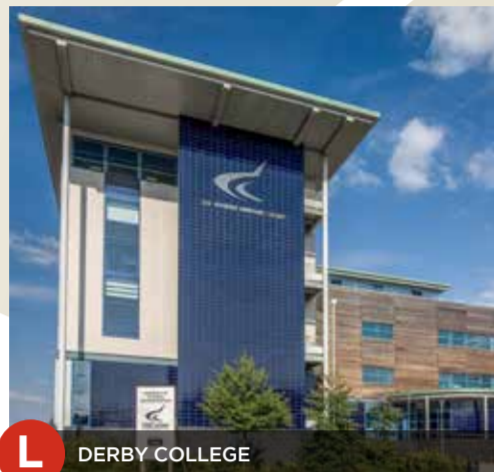
L DERBY COLLEGE