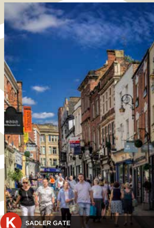
K SADLER GATE