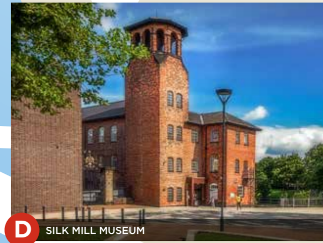
D SILK MILL MUSEUM