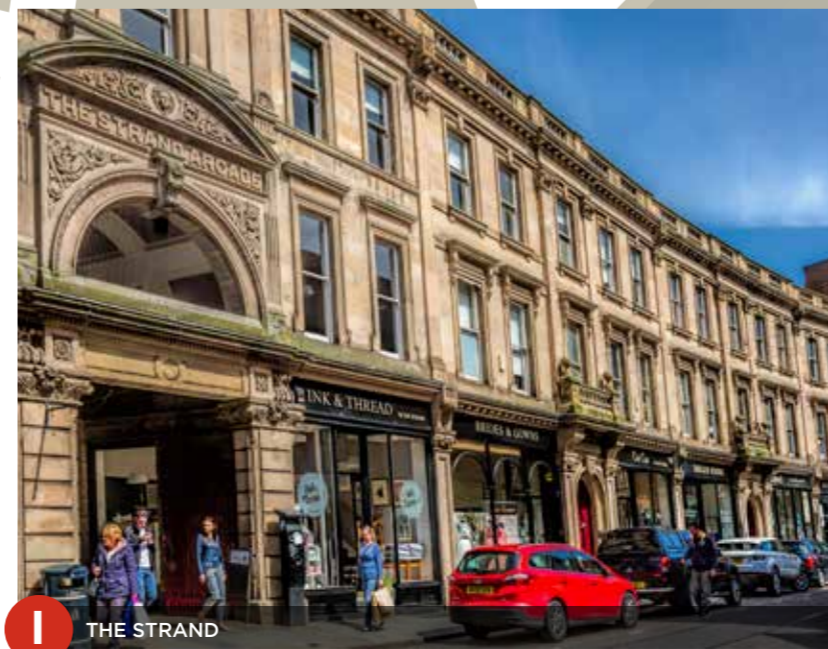
I THE STRAND