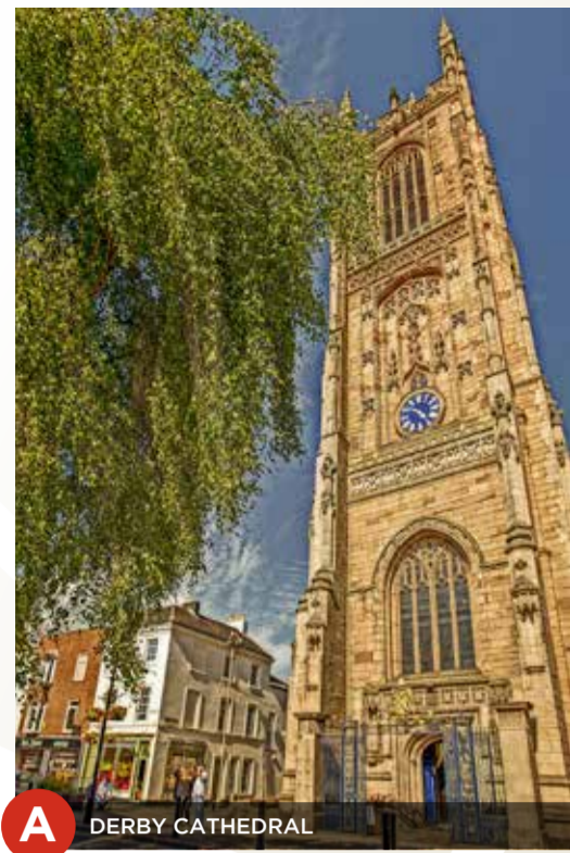
A DERBY CATHEDRAL