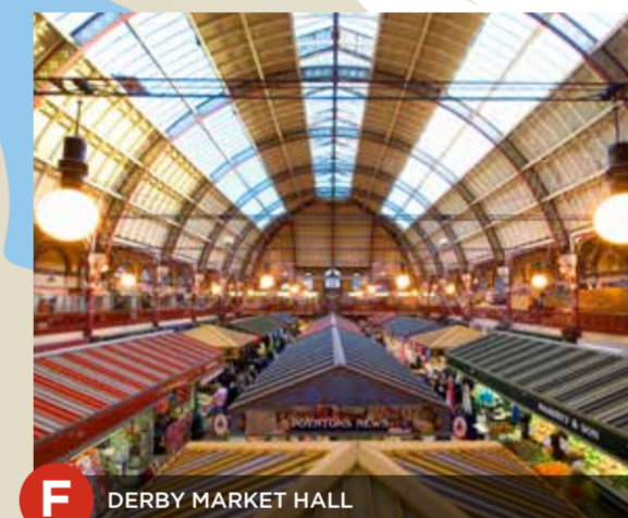
F DERBY MARKET HALL