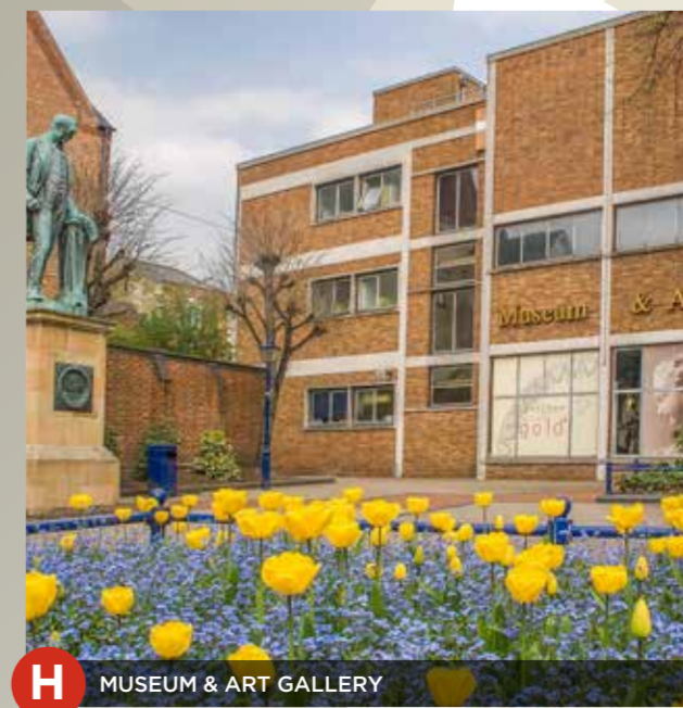
H MUSEUM & ART GALLERY

From Morledge, travel under the multi-storey car park, cross the ring road onto Siddalls Road and turn right where this meets Railway Terrace. The train station is 300 metres on your left.